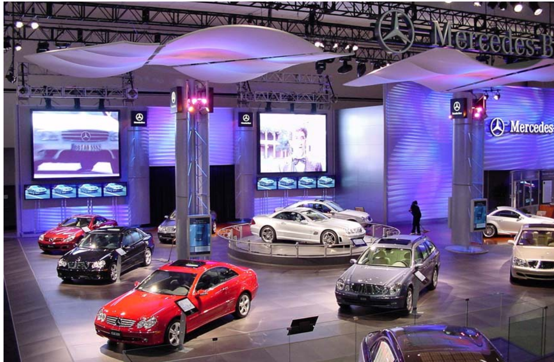
Mercedes LA / NY Auto Show Exhibit